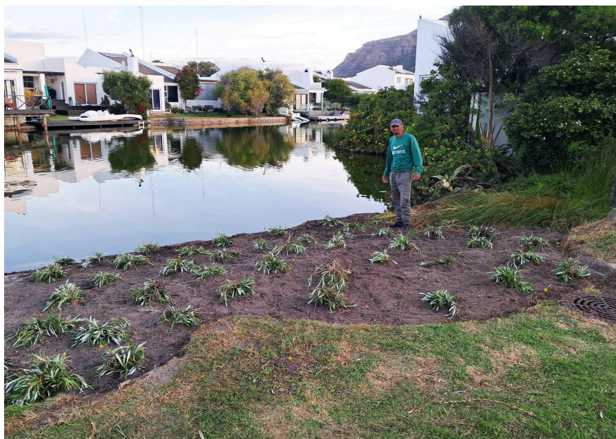
The new Strandveld beds that have been established in Thibault Park.